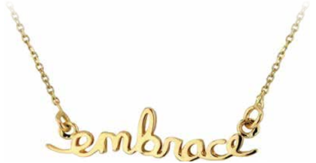
Gold "Little Notes" | $225 $30 donation card included