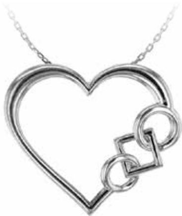
Silver Heart Pendant | $90 $30 donation card included