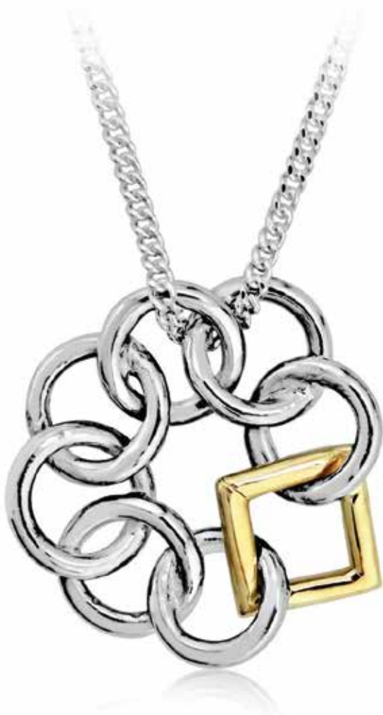
Two tone pendant | $195 (large) $30 donation card included | $170 (small)