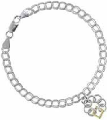
Charm bracelet | $195 $30 donation card included