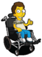
The Eric Brigandi Foundation