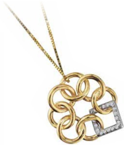
Gold & diamond pendant | $850 $100 donation card included

Interconnecting circles connected by a square show that we are all linked together. Wearing this symbol is a simple reminder to be kind and accepting, no matter what difference we may have.