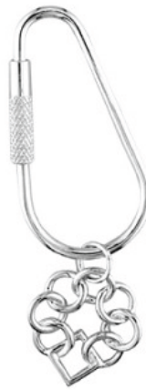
Mini Keychain | $125