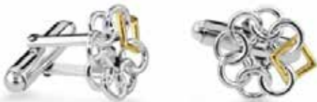
Cuff Links | $250