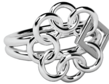
Sterling Silver Ring | $170 (large) $150 (small)