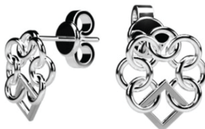
Sterling Silver Earrings | $150