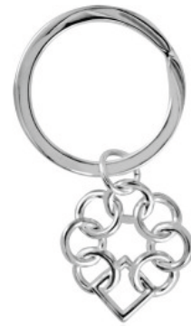
Sterling Silver Keychain | $95