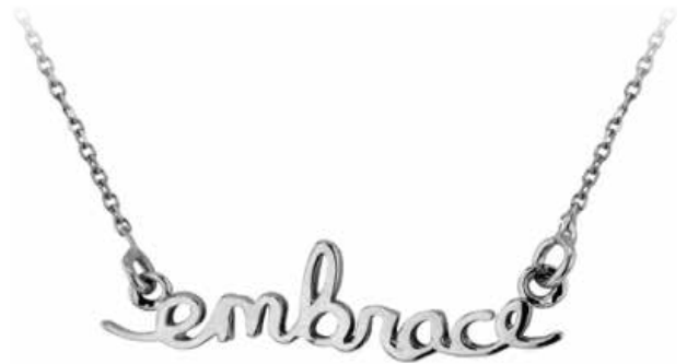
Silver "Little Notes" | $125 $30 donation card included