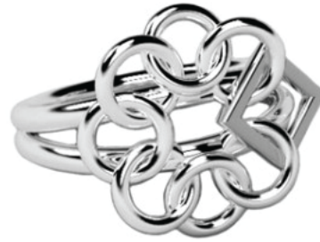
Sterling Silver Ring | $170 (large) $150 (small)