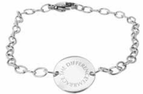
Chain link bracelet | $30 $10 donation card included