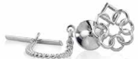
Silver Tie Tac | $95