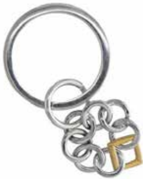
Two-Tone Keychain | $150