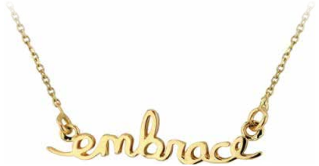
Gold "Little Notes" | $225 $30 donation card included