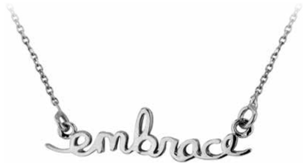
Silver "Little Notes" | $125 $30 donation card included