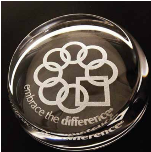
Paperweight | $50