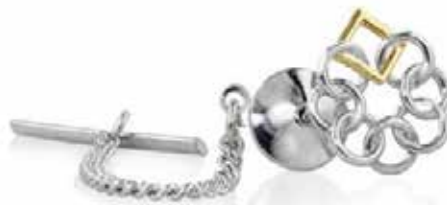
Tie Tac | $150