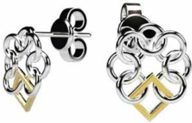
Two-Tone Earrings | $250