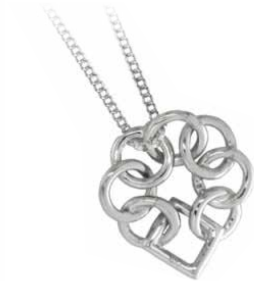
Sterling Silver pendant | $125 $30 donation card included