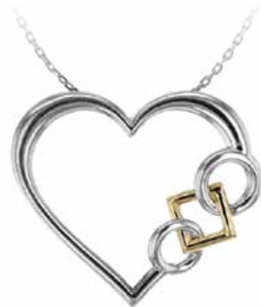
Heart Pendant | $170 $30 donation card included