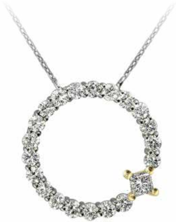
1 1/2 ct Diamond Pendant | $995 $100 donation card included