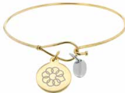
Charm bangle | $30 $10 donation card included