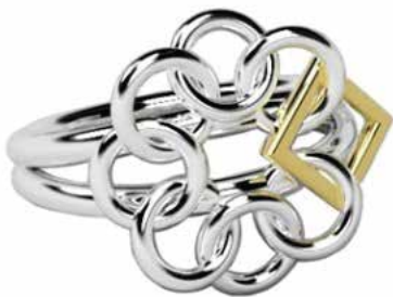
Two-Tone Ring | $265 (large) $195 (small)