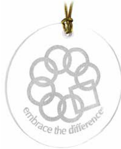
Ornament | $30