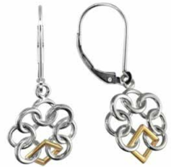
Two-Tone Dangle Earrings | $299