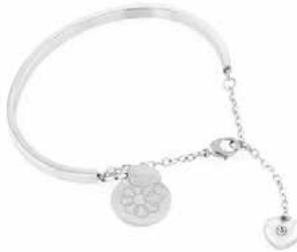
Heart bangle | $30 $10 donation card included