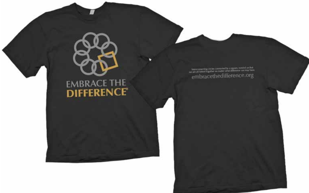
T-Shirt | $25

FOR THE FULL LINE VISIT, EMBRACETHEDIFFERENCE.ORG